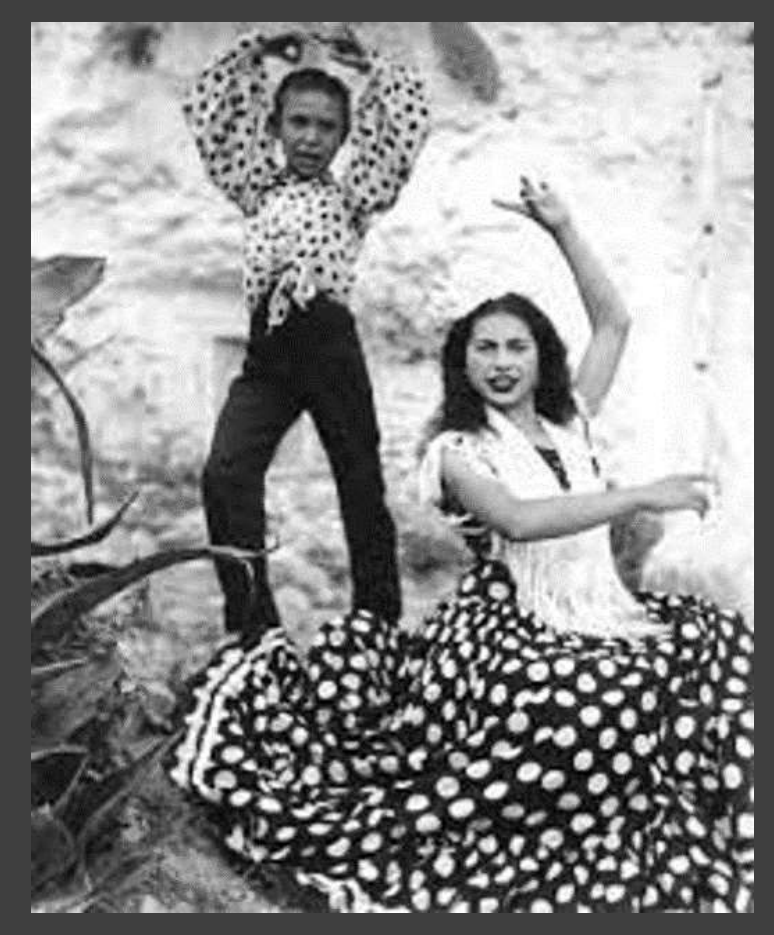
Spain – 1952