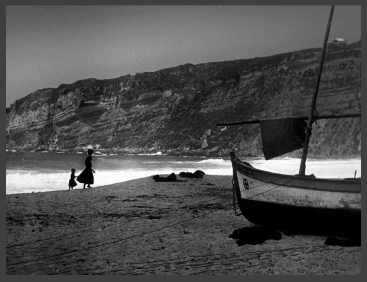
Nazare, Portugal - 1952