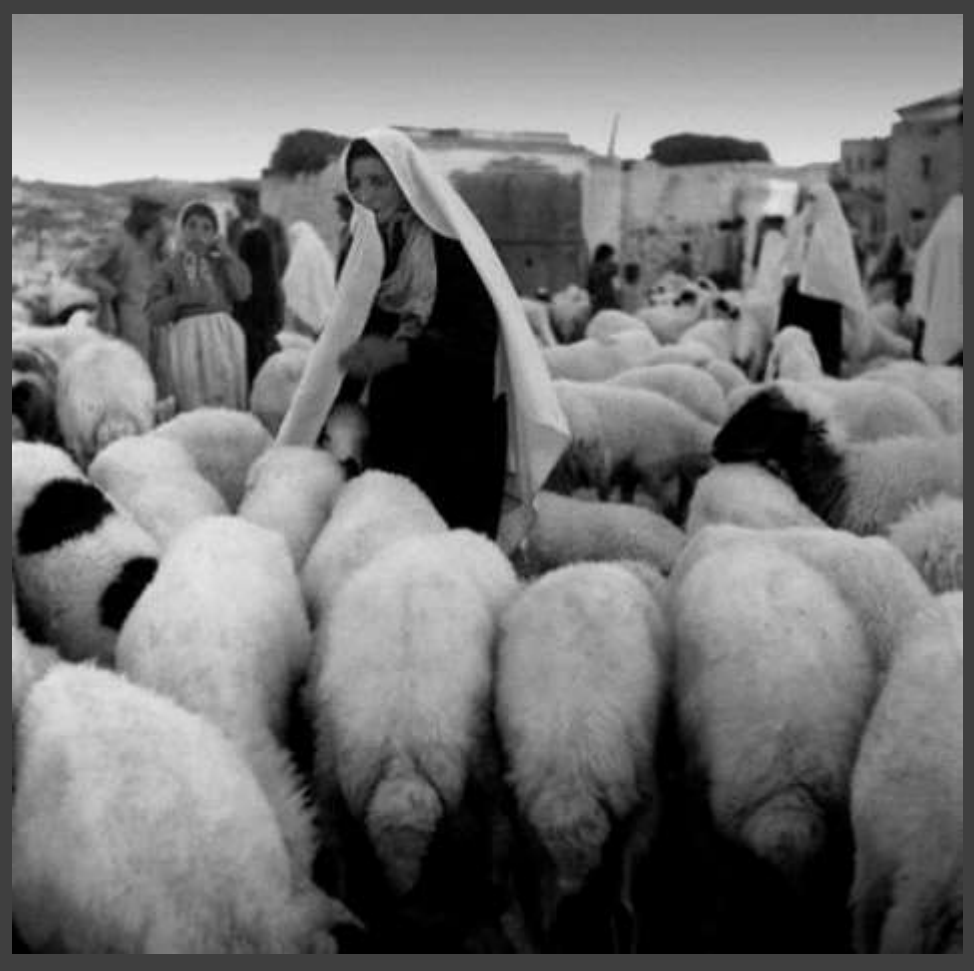
Anatolia - 1956