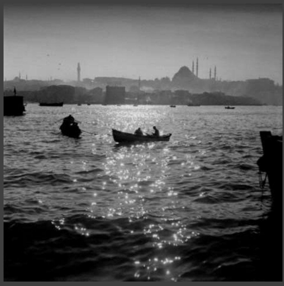
Halic, Istanbul – 1954